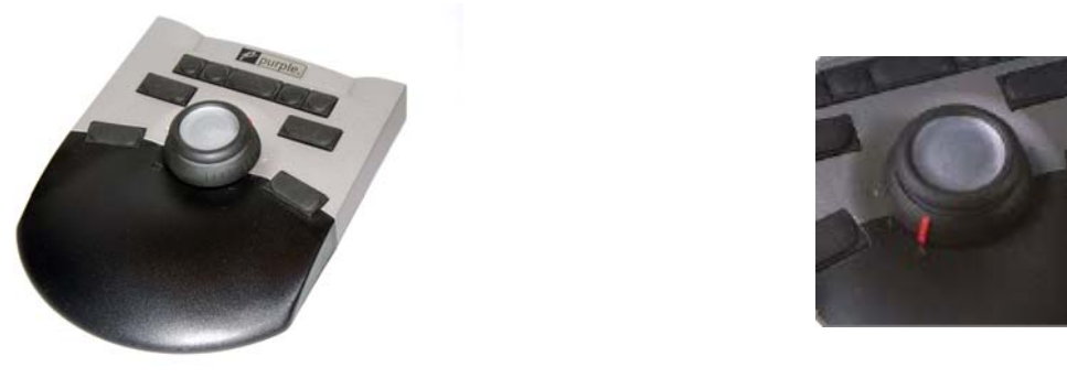
The Avid/Pinnacle Jog Shuttle Controller is key programmable and is a fast and convenient alternative to the keyboard.